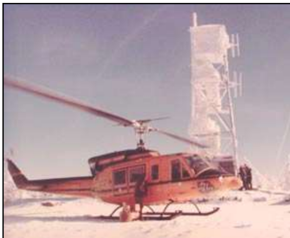
Photo of a Huey landing at Blue Mountain, just north of Indian Lake, where it was dispatched to deploy radio technicians to service a transmitter on top of the mountain. Notice the ice on everything!

After introducing the audience to New York State's aviation sites and equipment, Mike showed a video of the rebuilding of the Lake Colden control cabin after a fire. He and other pilots brought in the lumber for the project because the cabin was 6 miles from a road and was in a wilderness area where trees could not be harvested.