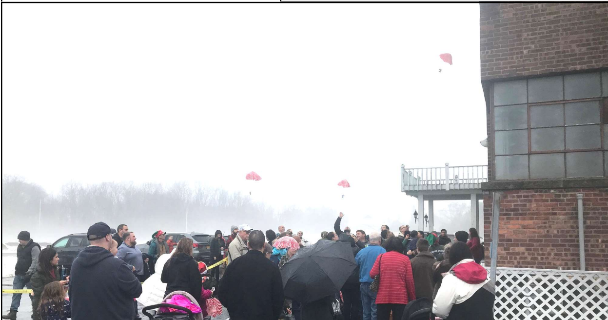
Parachutes fall from the sky (actually from the second story window) after the Candy Bomber story