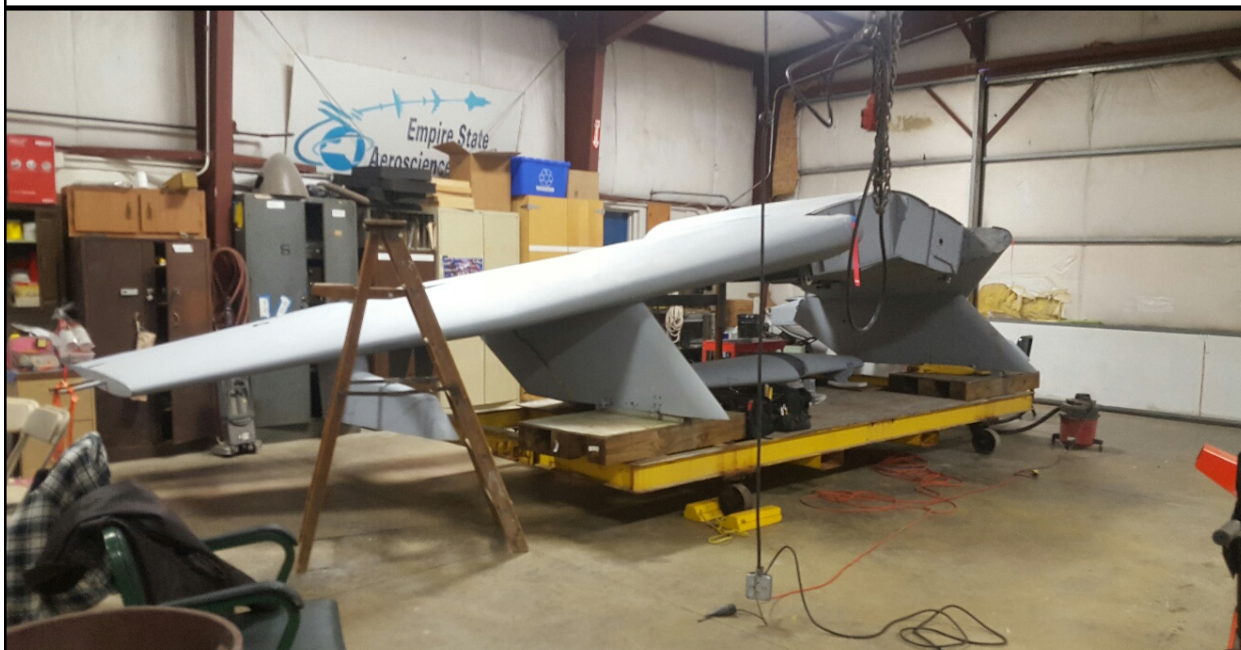
Harrier Wing positioned in the Restoration Hangar

The wing of the museum's newly acquired Harrier has been moved to the Restoration Hangar for winter-time work. This is the first step in preparing the jump-jet for display. Sanding and painting has begun.