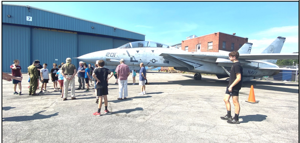
STEM campers learning about forces of flight get a close up view of ESAM's F-14 (Top Gun) Tomcat