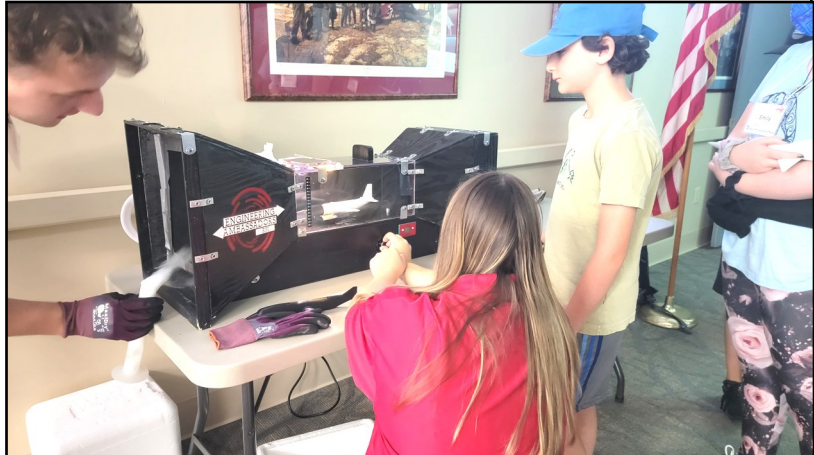
RPI Engineering Ambassadors help students test and evaluate their aerodynamic designs in a wind tunnel

First, on three consecutive Saturdays beginning on July 30, classes were conducted by the RPI Engineering Ambassadors for fifteen students, ages 12-17. Undergraduate engineering students conducted classes on a variety of aviation topics, including the evolution of aircraft design, aircraft materials, and sensors. ESAM volunteers assisted the Engineering Ambassadors and led museum tours after each class. The program was organized by ESAM Trustee and RPI alumnus Rich Bievenue , and it was hugely popular with the students.