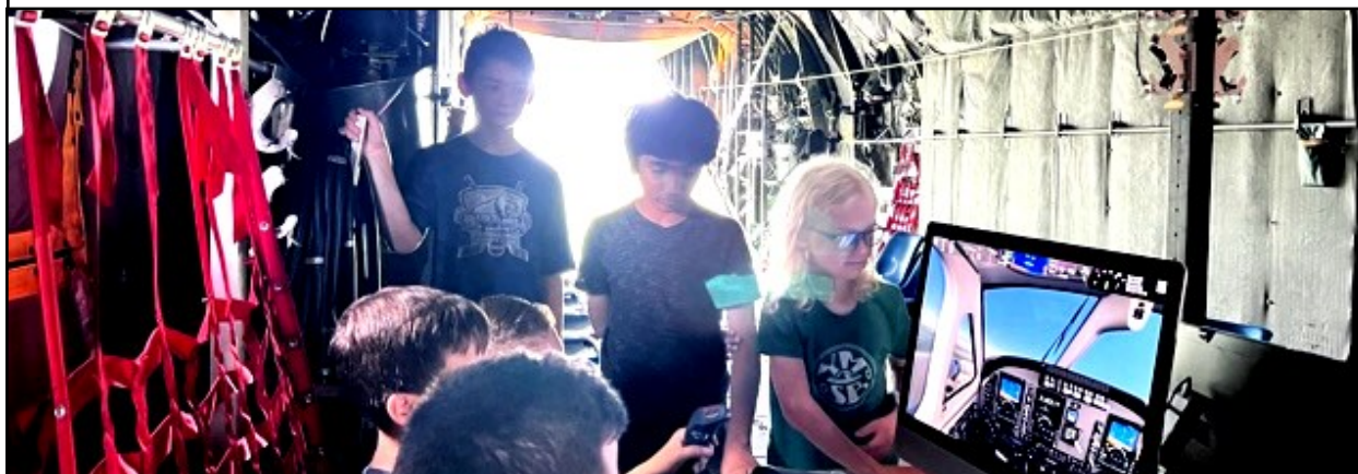
Kids fly the flight simulator that was set up in ESAM's C-130 during National Aviation Week